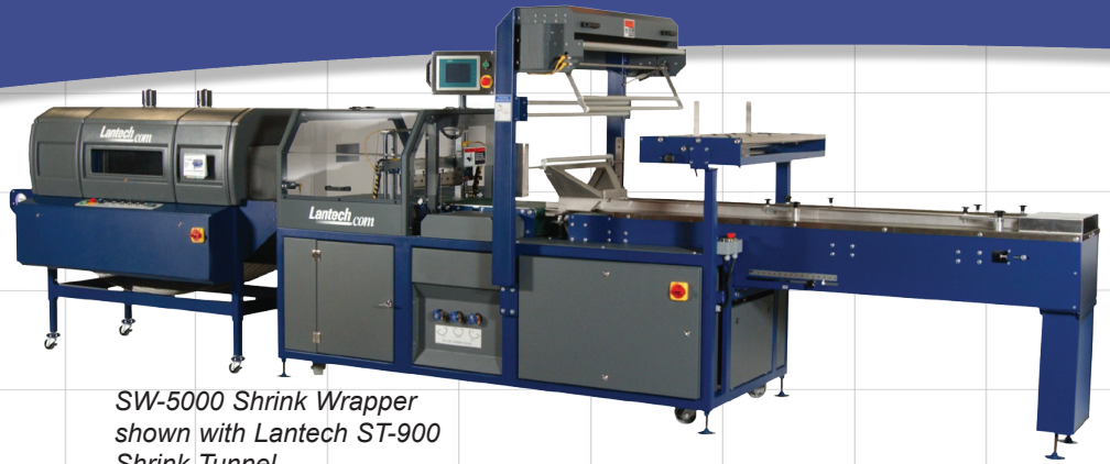
SW-5000 Shrink Wrapper shown with Lantech ST-900 Shrink Tunnel.